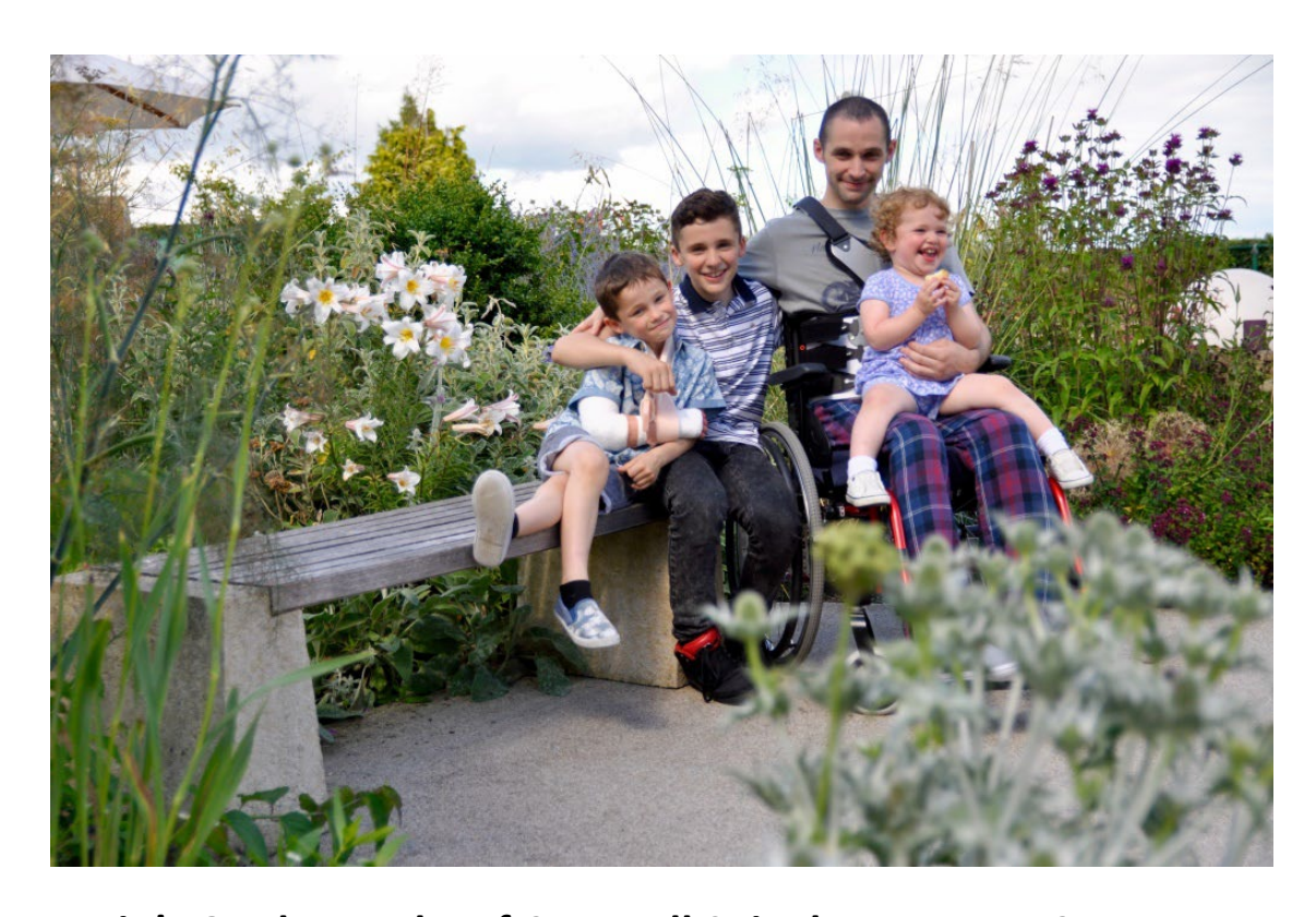
Horatio's Garden, Duke of Cornwall Spinal Treatment Centre Salisbury District Hospital