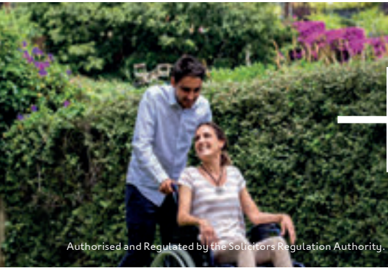
Authorised and Regulated by the Solicitors Regulation Authority.